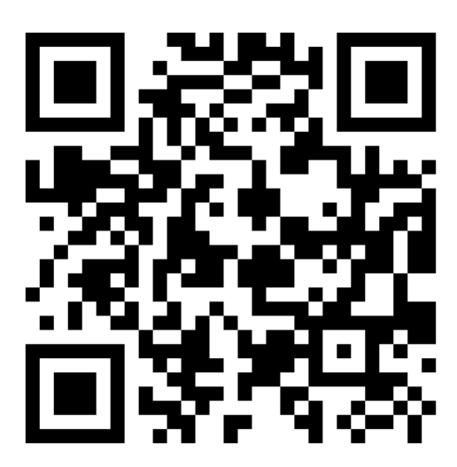
Figure 3: Solve these Avoid checkmate puzzles 11 to 20 puzzles online or view solutions by scanning this QR code or goto the link below