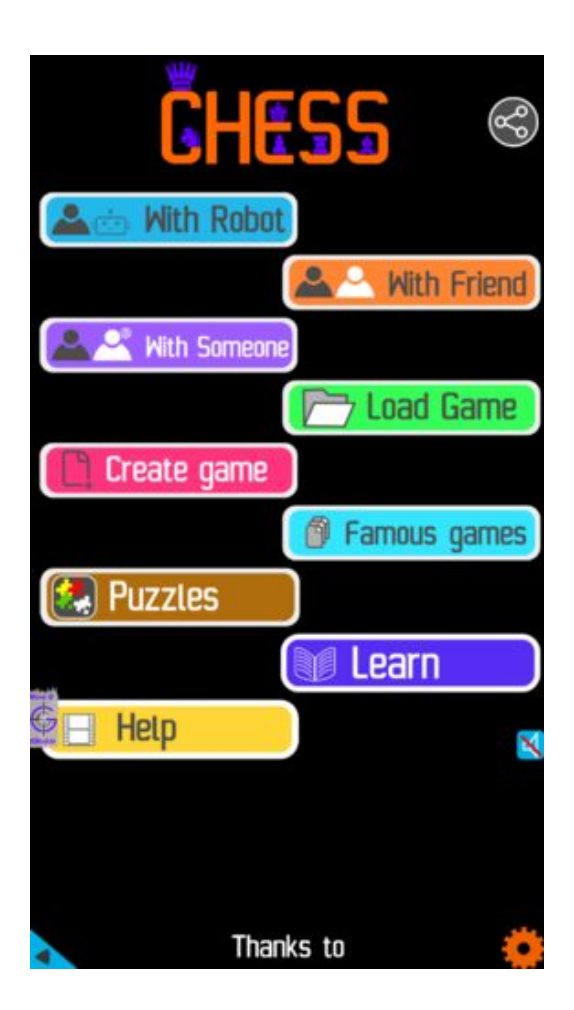
Figure 2: Play chess online for free. Solve puzzles and play with friends

Play chess for free at https://gbud.in/chs